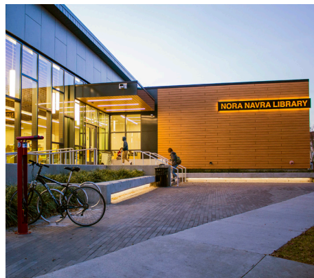
New Orleans Public Library Nora Navra Library Prime | $3M | 2018 AIA Design Award