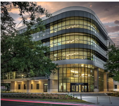
Delgado Community College Center for Nursing and Allied Health JV | $40M | 2023 AIA Design Award