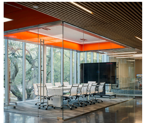
General Informatics @Highlands Headquarters: JV Lead Master Plan: Prime $11M | 2019